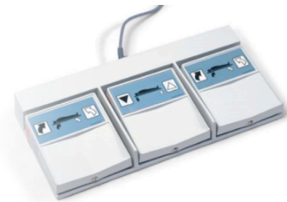
Optional 3 movement foot control shown