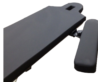
Optional arm board